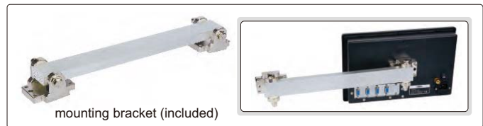
mounting bracket (included)