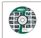
software CD (included)